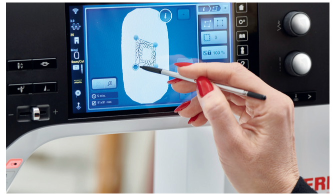
4-Point Placement with Morphing