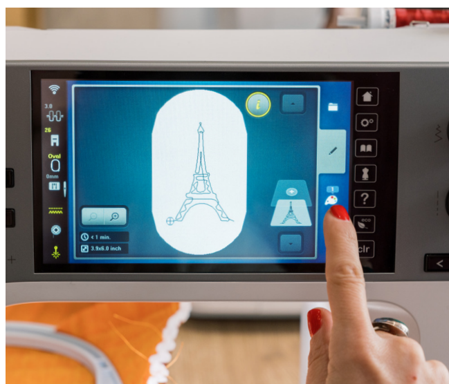
400 built-in embroidery designs including 100 quilting designs