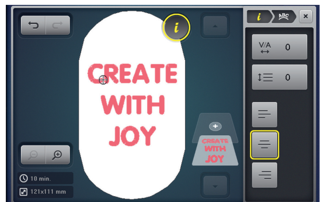
Multi-line Lettering and Align