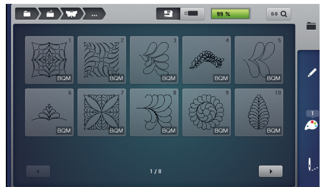
Customizable Quilt Designs